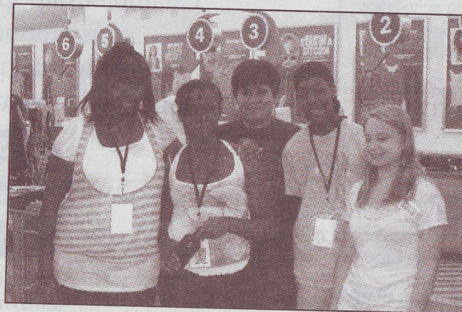
Glen Cove Boys & Girls Club SAFE Summer Fun participants enjoy the Camp Old Navy Program.

To view more pictures of the SAFE Summer Fun program, visit www.Safe-glencove.org or www.facebook.com/GlenCovePRIDEProjectCoalition .