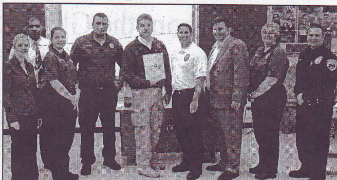
Participants from the Glen Cove Police Department were trained in PACT360, making them the first police department on Long Island to be so.