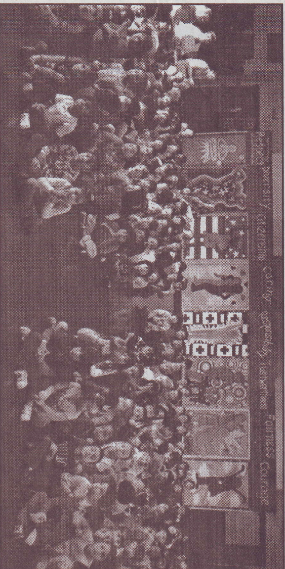
Students participate in the Deasy Red Ribbon Week assembly.