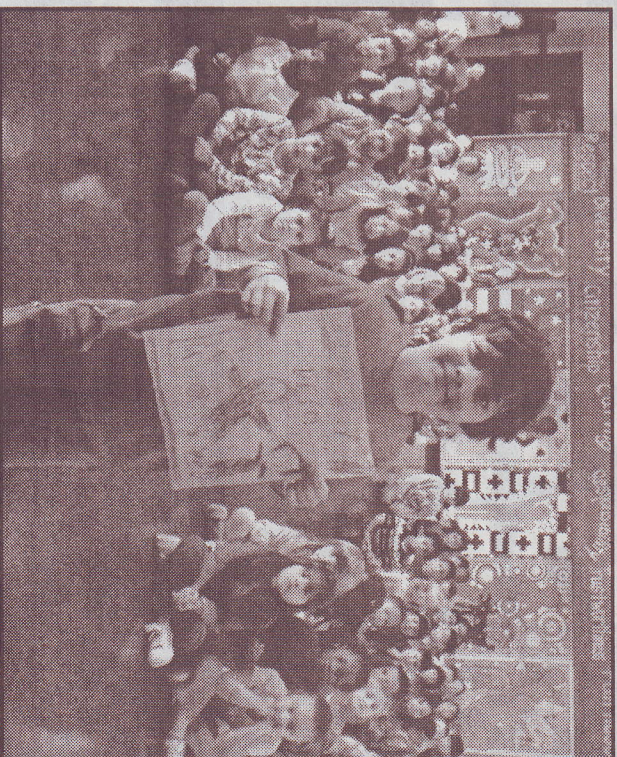
A Deasy poster contest winner poses with his Deasy School classmates.