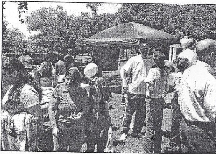
Mayor Suozzi was among the crowd of attendees at the event.

SAFE Inc., is a not-for-profit tax exempt substance abuse education and prevention agency located in Glen Cove. Visit www.safeglencove.org or call 676-2008 for further information.