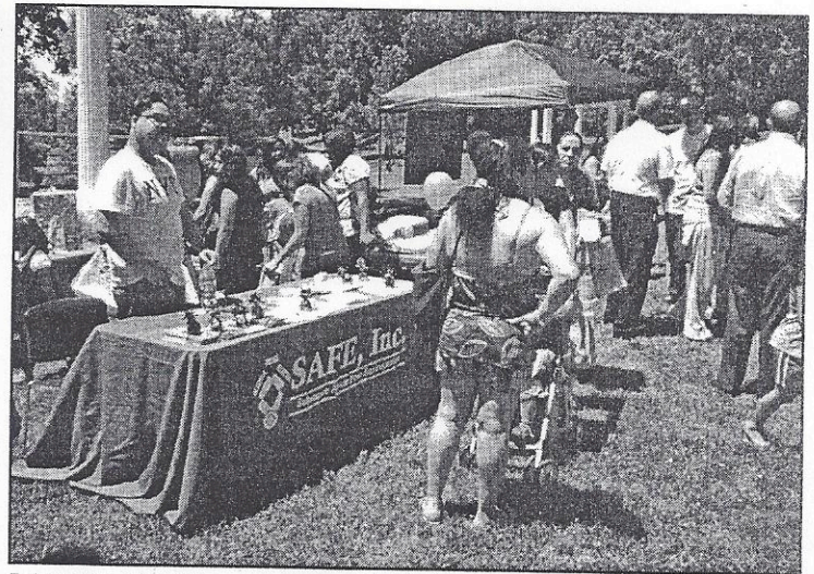
Information about the agency was available throughout the day.