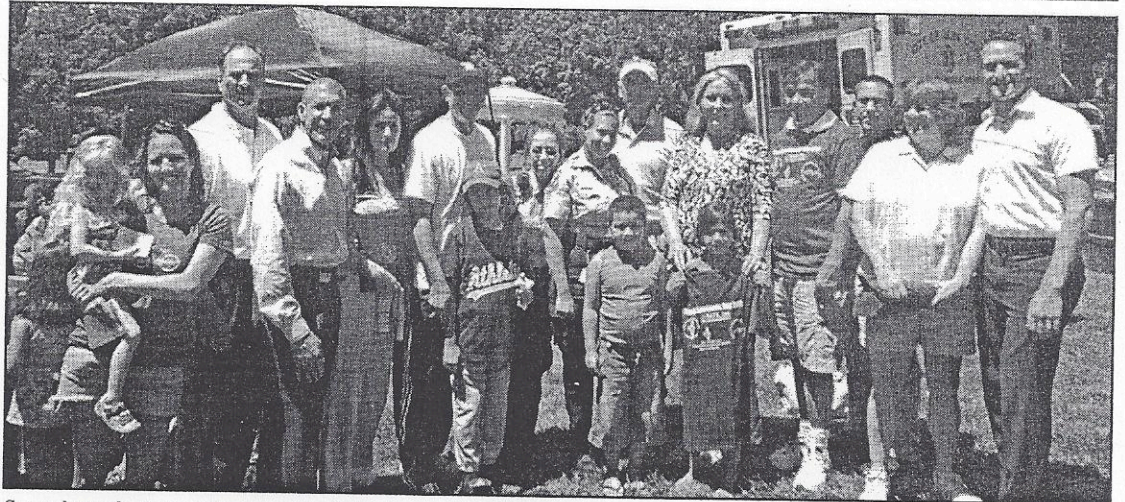
Several people shared the day with SAFE, Inc. staff, volunteers, and residents including Mayor Ralph Suozzi and Legislator Delia DeRiggi-Whitton.

There was another message that SAFE was promoting at Family Awareness Day; that people can enjoy themselves without alcohol or drugs. There were long lines at the bouncy castle, several children went inside an ambulance and spoke to an EMS volunteer and everyone couldn't seem to get enough of the popcorn, snow cones,