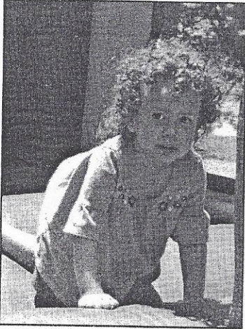
Children of all ages enjoyed the bouncy castle.