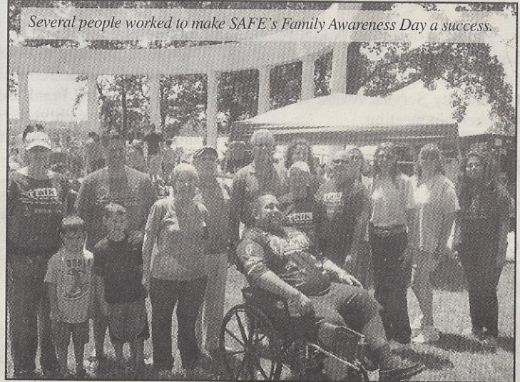
Several people worked to make SAFE's Family Awareness Day a success.