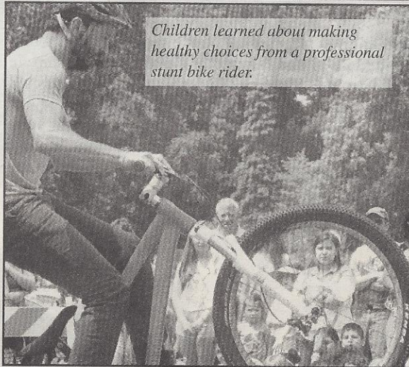
Children learned about making healthy choices from a professional stunt bike rider.