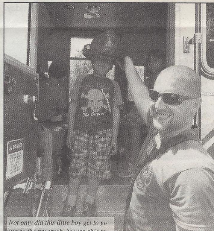
Not only did this little boy get to go inside the fire truck, he was able to